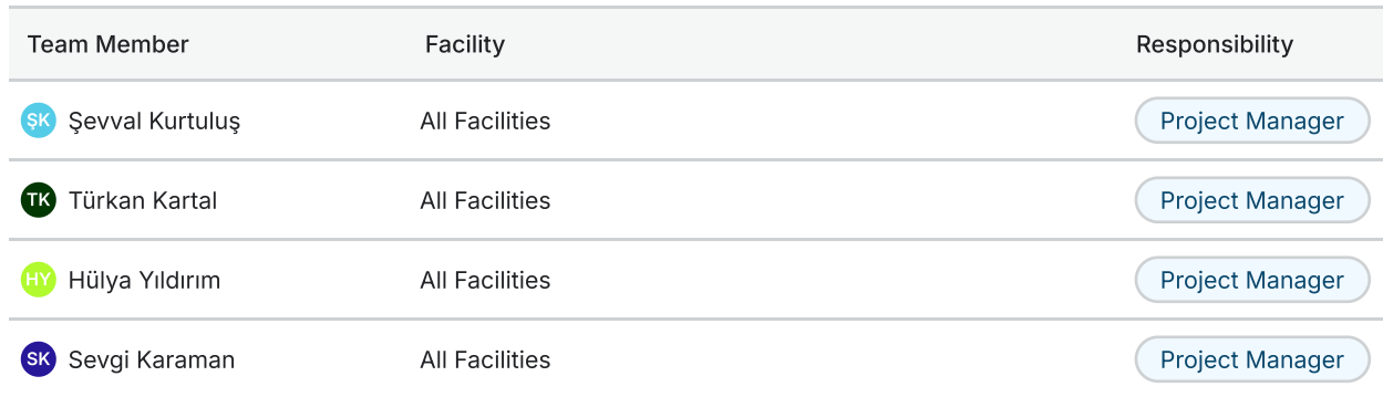
Table: Team Members Facilities and Their Roles

This section includes overall and specific responsibilities for preparing and producing the report.